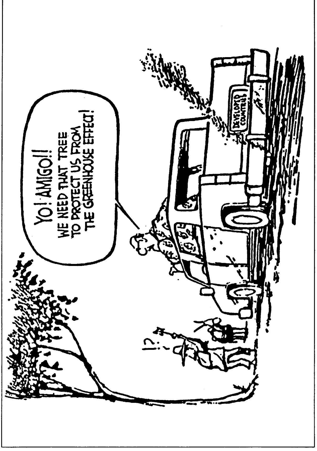
Figure 2: Cartoon image of international relations regarding tropical deforestation and greenhouse gas emissions (Source: San José Mercury News ).