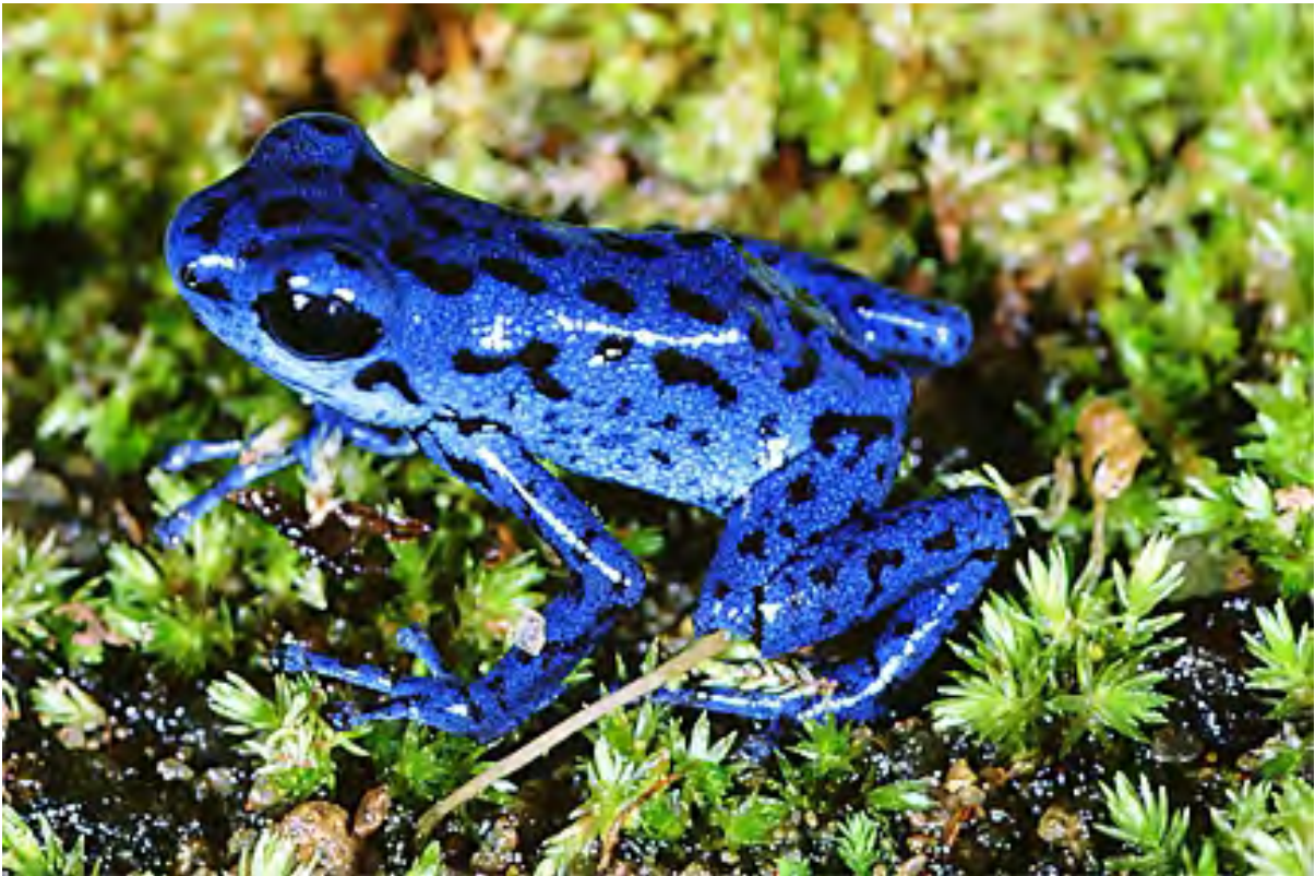
June 18, 2017

The “Land-Thieves Law” was not among the measures vetoed by President Temer. It awaits his decision, until July 4.