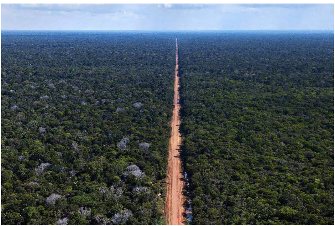
BR-230, also known as the Trans-Amazonian Highway; the R-163 Cuiába-Santarém road; and the BR-319 Manaus-Porto Velho road, shown here, are official roads that cut across the Amazon and have spawned a network of illegal offshoots.

The best example is the reconstruction of the BR-163 (Santarém-Cuiabá) highway, which was licensed in 2006 based on the hypothesis that the "Sustainable BR-163 Plan" would avoid deforestation. This program included 32 non-governmental organizations plus the federal government and had the participation of some of the best environmentalists and academics in the country. The then environment minister, Marina Silva, declared that BR-163 would be a "corridor of sustainable development." The real history that unfolded did not follow this scenario: the area became, and still is, one of the Amazon's biggest hotspots of deforestation, land grabbing, illegal logging, and "wildcat" mining. In 2019, a "day of fire" was organized from Novo Progresso, on BR-163, when ranchers across the Amazon agreed to burn on the same day to show President Bolsonaro that they were "developing" the Amazon. BR-163 generated the invasions of the Baú Indigenous Land, the land grabbing in the Jamanxim National Forest, and the side roads giving access to the western half of the Terra do Meio (a forest area the size of Switzerland).