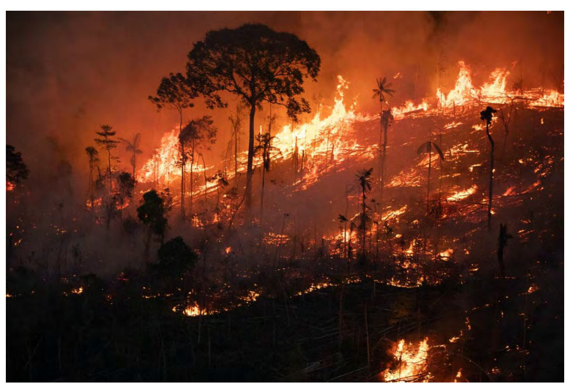
Figure 2. Burning in the AMACRO region, the major deforestation hotspot where the states of Amazonas, Acre and Rondônia meet, which will be connected to vast areas of intact forest by BR-319 and associated roads. Actors and processes from this region can be expected to move to areas opened by the project. Photo: Nilmar Lage/Greenpeace/30/08/2022

One of the topics under discussion is the creation of conservation units (protected areas for biodiversity). This is good, and many of them should be created quickly, before the areas are invaded and deforested. Some of these areas should be of the "full protection" type, but most could be of the "sustainable use" category, as long as they are not "environmental protected areas" (APAs), which allow private properties and offer almost no protection. All undesignated public forest areas should be converted into either conservation units or Indigenous lands, and nothing legalized as private property. This should not only be along the BR-319 route, but throughout the impacted area, including the Trans-Purus region.