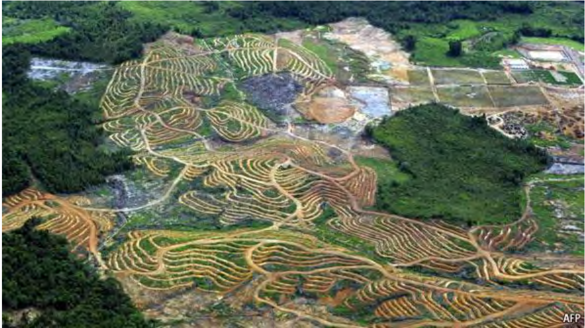
Rainforest into cooking oil

FROM a helicopter, East Kalimantan, a province in the Indonesian part of the island of Borneo, presents a dreary view. Where little over a decade ago rainforest transpired under a vaporous haze, the ground has been cleared, raked and gouged. Every few minutes, a black smudge, smattered with muddy puddles, denotes a coalmine. Angular plantations, 10km and more across, are studded with dark green oil palms. Tin roofs glitter on the shacks of loggers, miners and planters, each with a smallholding hacked out around it. Just a few straggly patches of forest remain, with greying logs scattered at their edges.