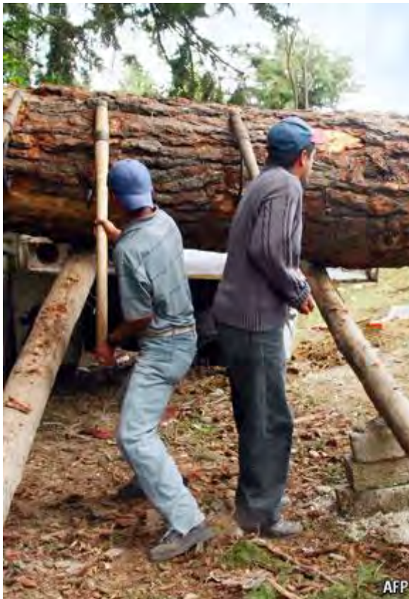
Pushing together in Michoacán