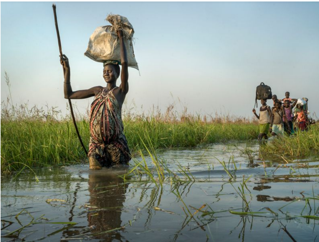
Wetlands, such as this one in South Sudan, are often neglected in emissions models.