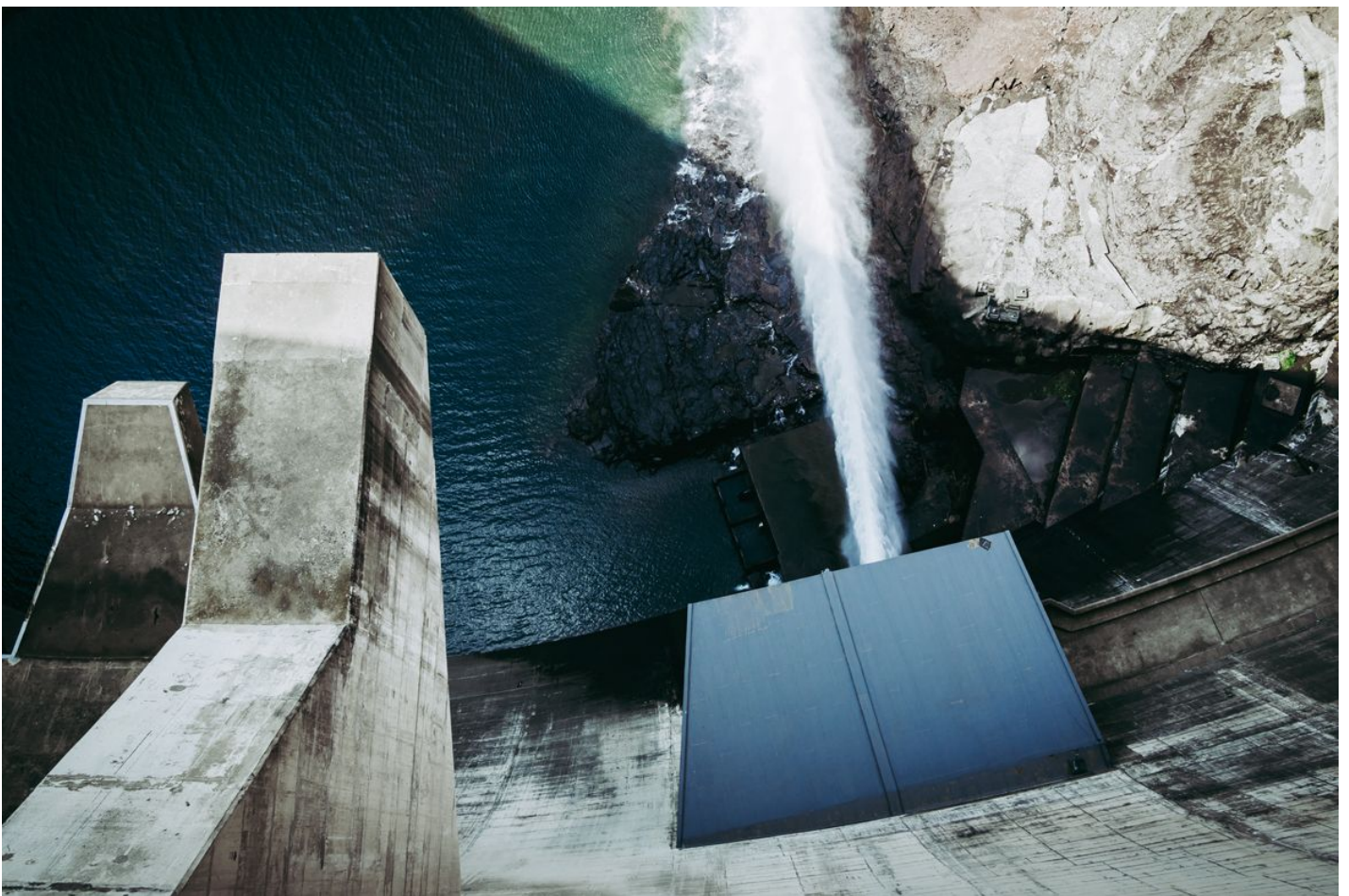
The Katse dam on the Malibamat'so River in Lesotho was completed in 2009.

Every few years, a cyclone hits Mozambique's Sofala province. The Pungwe River floods and severs road connections between Zimbabwe and coastal ports, sometimes for months. After a few weeks, the standing water starts to bubble as flooded vegetation decays. This 'marsh gas' is methane, a greenhouse gas that is some 20 times more potent than carbon dioxide.