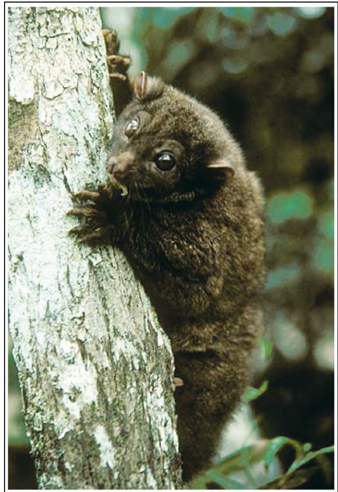
Figure 3. Many old-growth specialists, such as this lemuroid ringtail possum Hemibelideus lemuroides from tropical Australia, avoid fragmented or secondary forests (photo by William Laurance).

Another key consideration is that Wright and Muller-Landau focus on changes in net forest cover, rather than on old-growth forest. As the authors emphasize, in coming decades, vast areas of old-growth tropical forest will be cleared, logged, fragmented, or otherwise degraded, and some cleared areas will regenerate after land abandonment or be replaced by exotic tree plantations. In their projections, all forest types count equally, but the distinction between old-growth and regenerating or fragmented habitats can be profound for extinction-prone species (Figure 3), as various authors have contended (e.g. Refs [19,29–31]). Based on an extensive literature