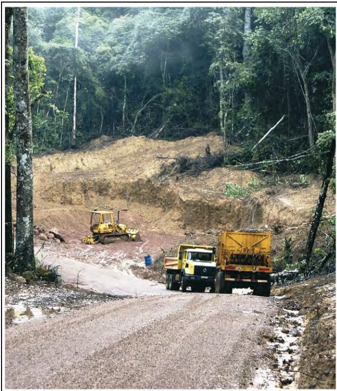
Figure 4. Expanding road networks for timber, oil and mineral extraction, such as this oil-project road in Gabon, promote sharp increases in tropical deforestation.

Another hotly disputed point is whether future pressures on forests will decline as a result of slowing rural population growth. Wright and Muller-Landau conclude that