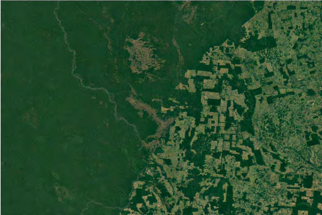
Google Earth image showing deforestation frontier in the Brazilian Amazon.