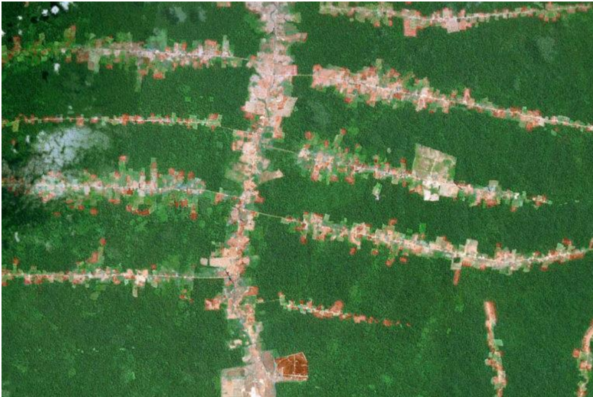
The “fishbone” forest fragmentation pattern created in the Amazon when a major road is constructed and then legal and illegal side roads are added later.

IBAMA and DNIT continued with the convening of the first hearing in Manaus on the night of September 27 in disregard of the MPF’s recommendation, but two hours before the start of the hearing an injunction by judge Mara Elisa Andrade partially endorsed the MPF’s recommendation, suspending hearings until the end of the pandemic. While the hearing participants waited (for approximately an hour and a half), this decision was overturned by a “ security suspension ” obtained through a phone call from the Minister of Transport to Ítalo Fioravanti Sabo Mendes, a “ desembargador ” (a high-ranking category of judges) in Brasília, who lifted the ban on the hearing. “Security suspensions” are a relic of Brazil’s 1964-1985 military dictatorship (Law 4348, of June 26, 1964), still in force (Law 8437 of June 30, 1992 and Law 12,016 of August 7, 2009), which allow any legal decision to be overturned if it would cause “serious harm” to “order, health, safety and the public economy” (see here and here ). In this case the highway is difficult to defend on the basis of the national economy. The security suspension claimed that the highway is needed