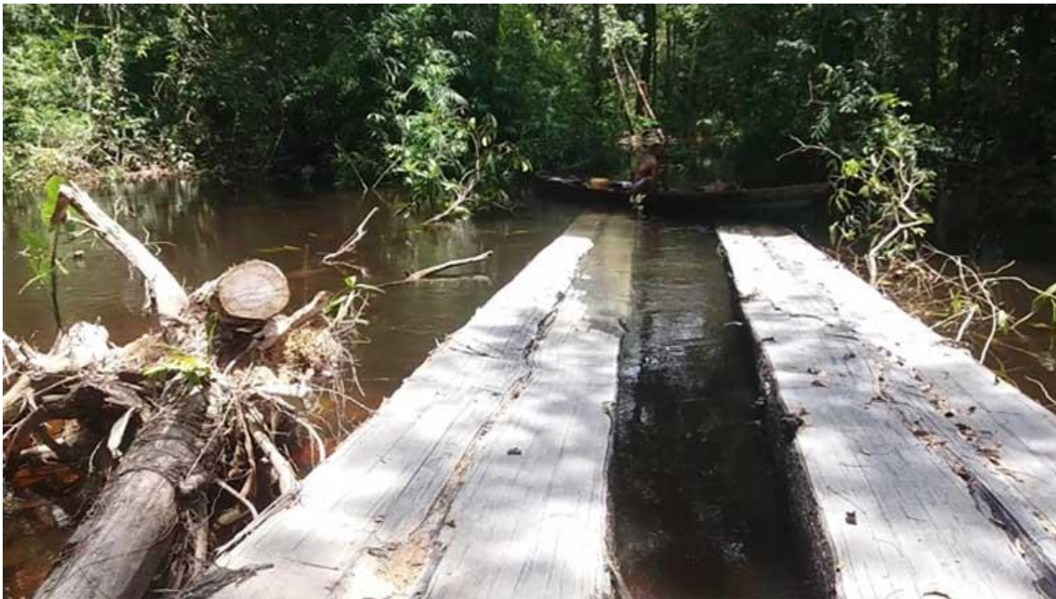
Bridge built across a stream in February 2020 on an illegal side road (ramal) branching off of BR-319 and penetrating a protected area, the Lago do Capanã Grande Extractive Reserve.

In addition to the construction of side roads by the government under pressure from the oil companies, the emergence of illegal endogenous side roads (“ ramais ”) is also likely. This is already happening in the case of the BR-319 itself (see here and here ), and the EIA even mentions one of them explicitly ( EIA, Part 5 , p. 3565). Virtually the entire route of AM-366 west of the Purus River is within an immense area of undesignated public land (“ terras devolutas ” or “vacant lands”), which is the land category that is most attractive to land grabbers, landless farmers, loggers, and other actors. What happens once a highway is built is largely beyond the government’s control. The image conveyed by the EIA and by the statements of politicians that governance would control these processes is simply fiction (see here and here ).