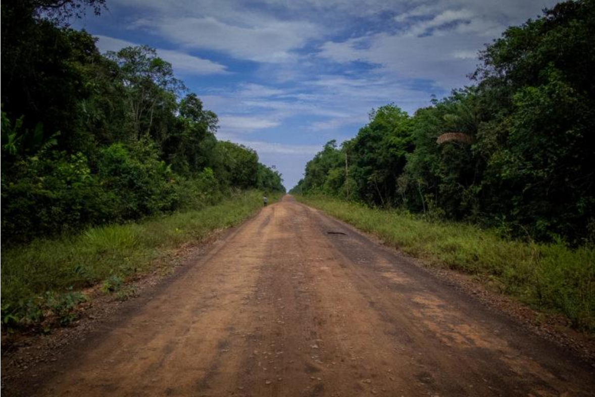
A portion of the unpaved BR-319 surrounded by thick tropical vegetation as it appeared in 2018.

FEEDBACK: Use this form to send a message to the author of this post. If you want to post a public comment, you can do that at the bottom of the page.