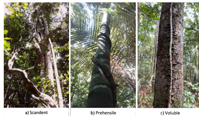
Figure 2. Climbing mechanisms.

The results depicted in Figure 2 shed light on the diversity of climbing habits among plant species in the studied fragment. Notably, the scandent climbing mode emerged as the dominant strategy, being observed in 56 species. In contrast, the prehensile mode was noted in 12 species, while the voluble mode manifested in 11 species. Delving into the specifics of the forest interior, an intriguing pattern emerged, with 70.89% of climbers employing the scandent climbing mechanism, underscoring its prevalence. Meanwhile, 15.19% exhibited the prehensile mode, and 13.52% embraced the voluble mode in this environment. At the forest edge, a nuanced shift in climbing strategies was observed, with 60.98% adopting the scandent mode, 31.71% opting for the prehensile mode, and 7.32% favoring the voluble mode.