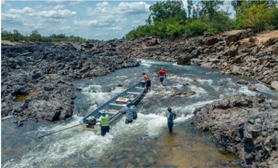
Fig. 2. Reduced water flow in the Volta Grande of the Xingu River, a 130-km stretch between the two dams that comprise the Belo Monte Hydropower Plant, decimates aquatic and seasonally flooded ecosystems, deprives traditional populations of fish and impedes transportation. (Watts, 2019).

In addition, protocols for impact assessment studies have not yet been developed for the severe changes to complex and interconnected Amazonian rivers and associated flooding cycles, which impact specific habitats and species and can affect extensive seasonally flooded areas downstream of dams (e.g., Gerlak et al., 2020; Latrubesse et al., 2017; RTAC/USAID, 2020; Schöngart et al., 2021). The protocols employed by staff hired by Norte Energia systematically fail to find any significant impacts, despite the disruption being obvious to local people and to independent researchers (Pezzuti et al., 2018; Zuanon et al., 2019). The environmental impact assessment for Belo Monte (Brazil, ELETROBRÁS, 2009) severely underestimated virtually all impacts of the project (Magalhães and Hernandez, 2009; Ritter et al., 2017). In addition to environmental impacts, multiple violations of human rights were committed in implementing the dam project (e.g., AIDA, 2018). Brazil's press coverage of Belo Monte and other dams has been found to downplay or ignore social and environmental impacts and to emphasize the narratives of the hydroelectric industry asserting that these dams are needed for economic progress (Mourão et al., 2022).