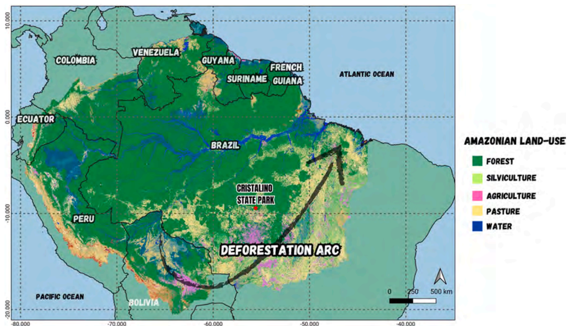
Fig. 1. Location of Cristalino State Park, Mato Grosso, Brazil. This is one of the only conservation units in the Arc of Deforestation and is of great importance for the conservation of biodiversity in the southern Amazon. This area is currently under threat due to its lack of official protection.

Throughout Brazil various bills propose the reduction or elimination of protected areas, with bills in the National Congress threatening to remove over 2.1 million hectares of protected areas in the Amazon alone (Bernard et al., 2014). Economic interests frequently drive this phenomenon, known as "PADDD" (Protected Area Downgrading, Downsizing, and Degazettement). Attempts to reduce or eliminate protected areas often exploit limitations in financial and human resources, land disputes, and judicial delays. As in other cases, the Cristalino II process advanced without consulting civil society, reflecting a shift in