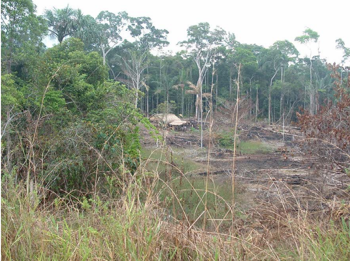
Figure 51.1. Squatters near the BR-319 (Manaus-Porto Velho) Highway. Squatters, including organised landless farmers ( sem terras ), are one of several groups of actors that deforest when roads are built.

fraud) (Fig. 51.2) (Fearnside 2008). A 2009 Brazilian law allowing illegal claims of up to 1500 ha to be legalised represents a setback in a transition to a land-tenure system based on the expectation that illegal invasions will not be rewarded.