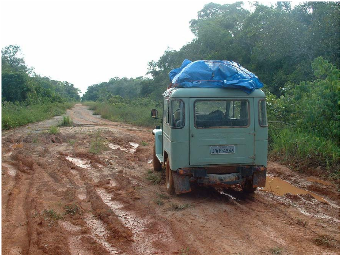
Figure 51.4. The BR-319 (Manaus-Porto Velho) Highway was abandoned in 1988 and is a barrier to human migration. Its planned reconstruction would connect central and northern Amazonia with the ‘arc of deforestation’ where clearing has been concentrated along the southern and eastern edges of the Amazon forest (see Fig. 51.3).

deficiencies in the environmental licensing and decision-making process provide ample lessons for those who are willing to listen (Fearnside & Graça, 2006).