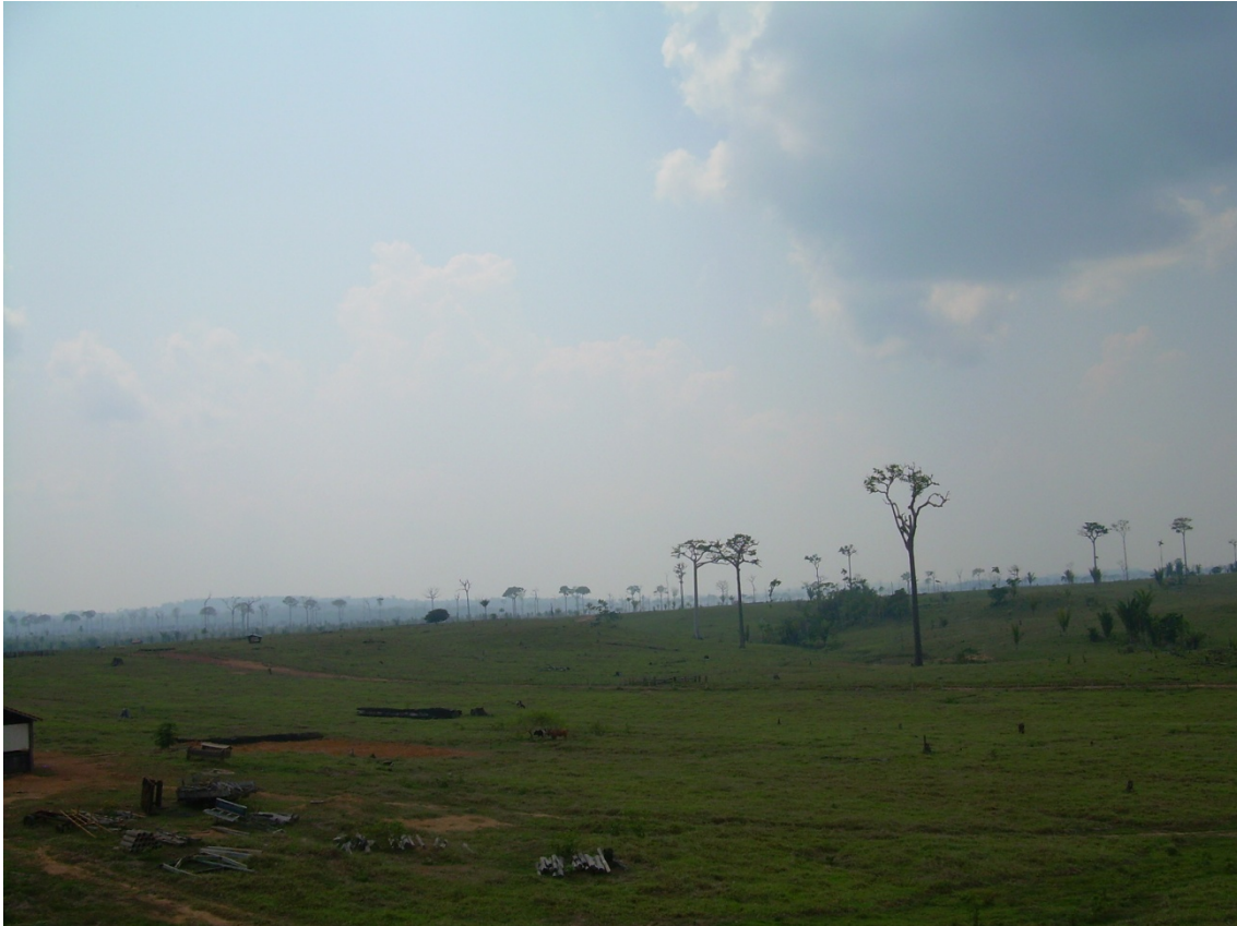
Figure 51.2. Cattle pasture in large and medium properties is the dominant land use in deforested areas. Here, grileiros (illegal landgrabbers) have established large ranches in the municipality of Lábrea (in the state of Amazonas) in an area with access by a privately constructed side road connected to the BR-364 Highway in Rondônia.