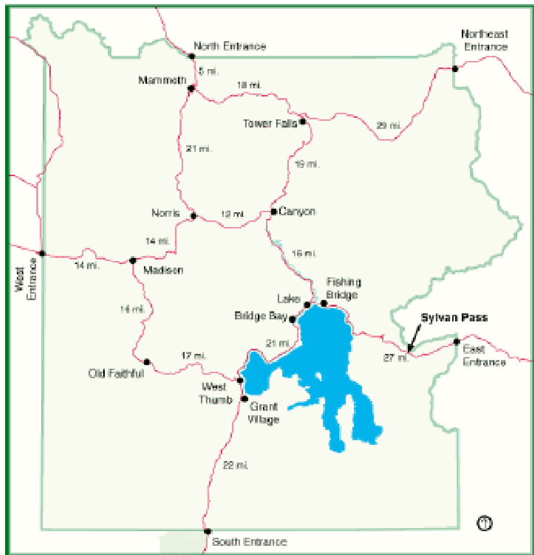
Figure 51.5. The EIA for the BR-319 Highway presents this map of Yellowstone National Park illustrating the presence of roads without the threat of deforestation (UFAM, 2009). The DNIT (National Department of Transport Infrastructure) logo in the corner of the map represents the road-building branch of Brazil's Ministry of Transportation. Unrealistic